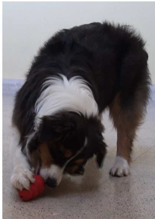
Figure 2. Motor lateralization: right paw use during stabilization of a food object (namely the “Kong”).

The existence of motor asymmetries at a population level is currently a subject of wide debate. It has been reported in several species, including humans [54], non-human primates [55,56], rats [57], humpback whales [58] and common European toads [59] but studies on other animals, as for example marmosets [60], sheep [61,62], cats [63] and horses [64,65], has shown a motor bias only at the individual-level. However, the same species may also display a limb preference at the level of population or at the individual level depending on the task, as found in monkeys [66,67], cats [68] and sheep [69].